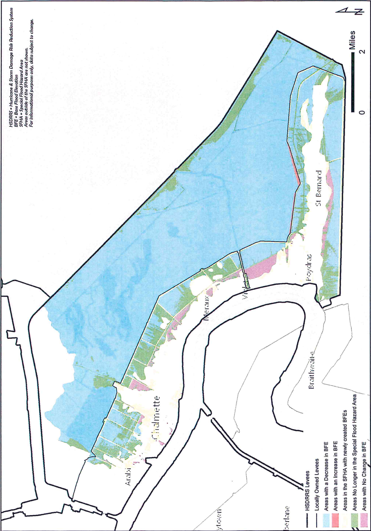
Comparison of Effective FIRM to 2015 Pending Preliminary FIRM Data, St. Bernard Parish, LA