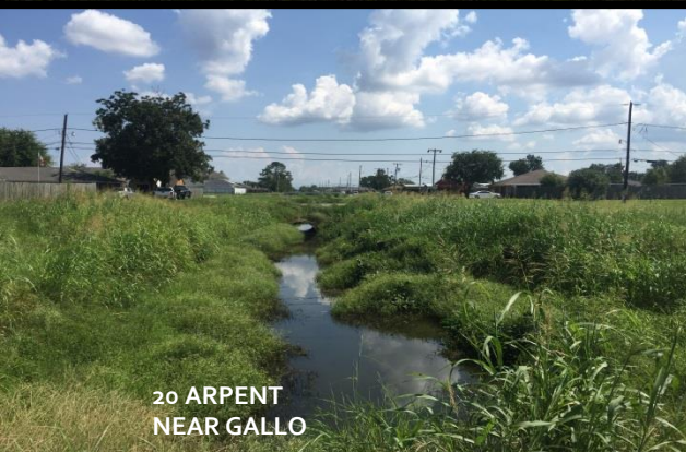
20 ARPENT NEAR GALLO