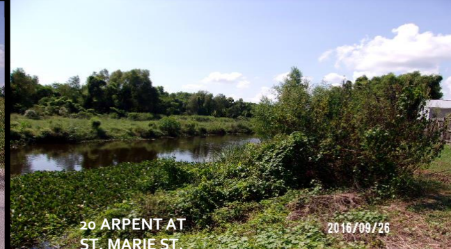
20 ARPENT AT ST. MARIE ST.