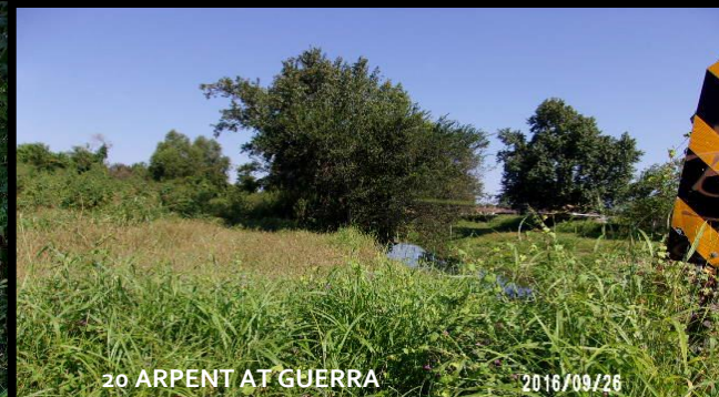
20 ARPENT AT GUERRA