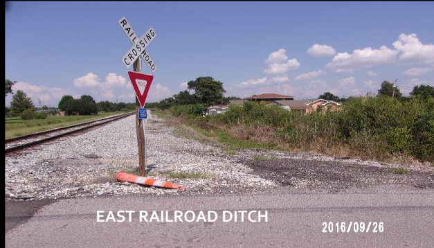
EAST RAILROAD DITCH