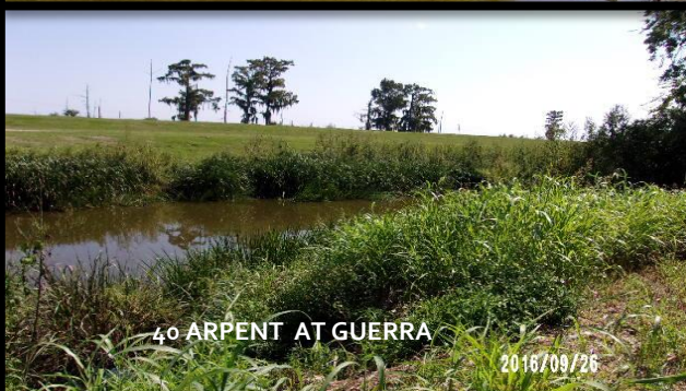
40 ARPENT AT GUERRA