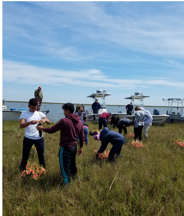
Chalmette High School volunteers planting black mangroves in the Biloxi Marsh