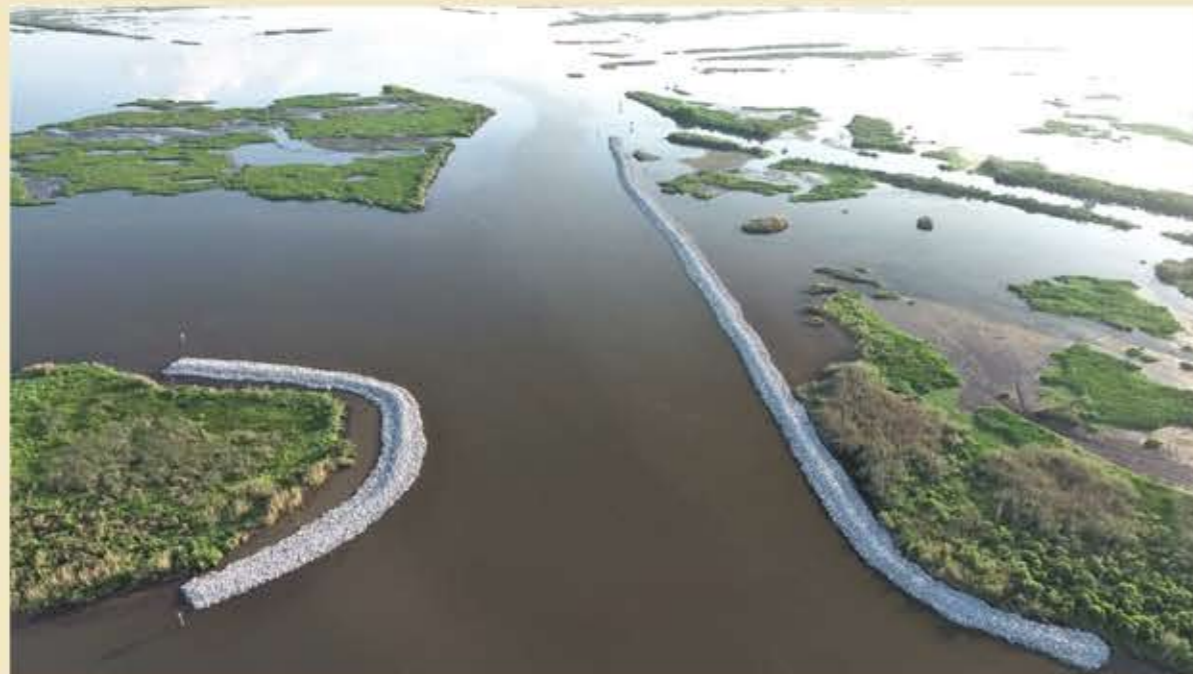
Phase 1 of the Bayou Terre aux Boeufs Ridge Restoration project