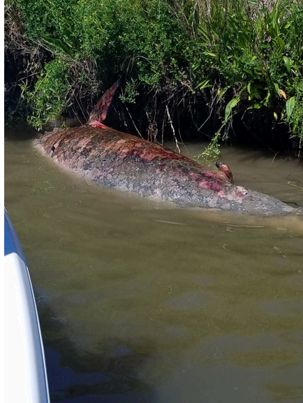
Image 3: Deceased Dolphin (C) Discovered in St. Bernard Parish on April 11, 2019