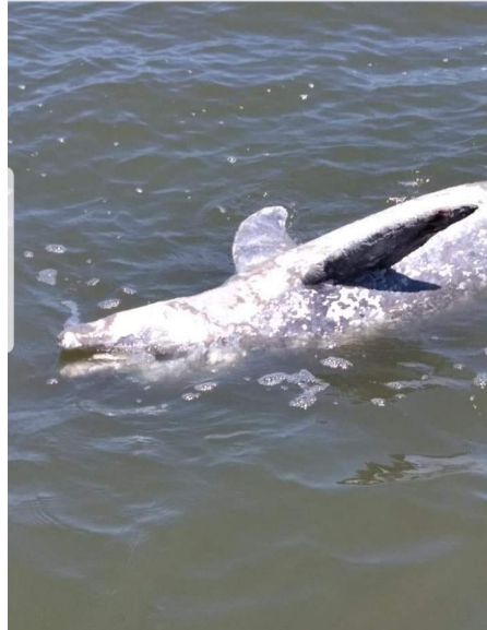
Image 5: Deceased Dolphin (W) Discovered in St. Bernard Parish on April 28, 2019