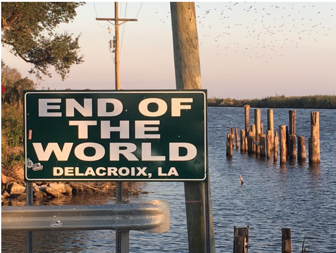
The end of Delacroix Highway at Bayou Terre aux Boeufs