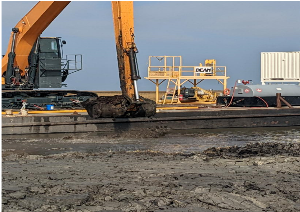
Lake Borgne Marsh Creation Project Site