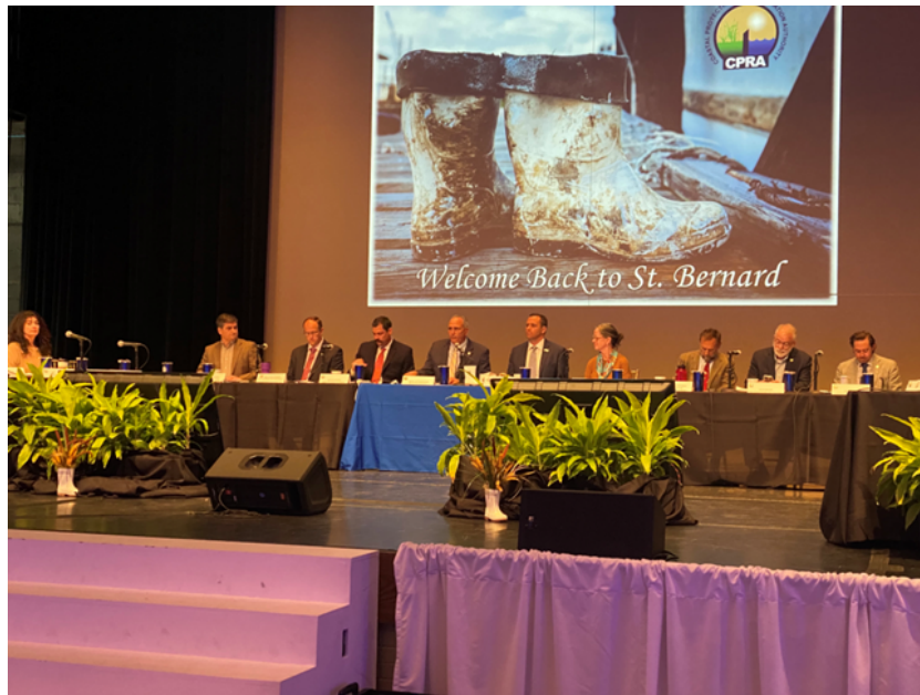
CPRA Board meeting in Chalmette (2022)

The Administration, St. Bernard Parish Council, and SBPG Coastal Division also played a leadership role during several crises that occurred over the past eight years, including the Gulf of Mexico Freshwater Flooding (2019) Federal Fishery Disaster and associated marine mammal unusual mortality event. Parish officials were the first to observe and document dolphin strandings in St. Bernard Parish waterways, and ultimately reported thirty-eight (38) deceased or distressed dolphins to the National Oceanic and Atmospheric Administration (NOAA). This initial report triggered a regional investigation that resulted in the discovery of 337 dolphin strandings between Louisiana and Florida. NOAA declared this phenomenon an unusual mortality event and identified the cause as “exposure to low salinity waters resulting from extreme freshwater discharge from watersheds” ( https://www.fisheries.noaa.gov/national/marine-life-distress/2019-bottlenose-dolphin-unusual-mortality-event-along-northern-gulf ).